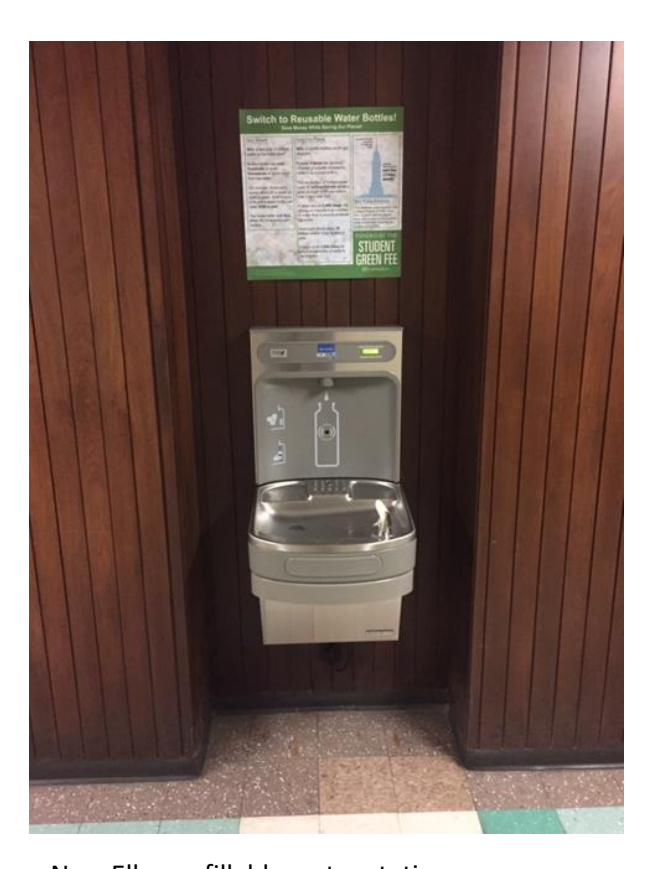
New Elkay refillable water station