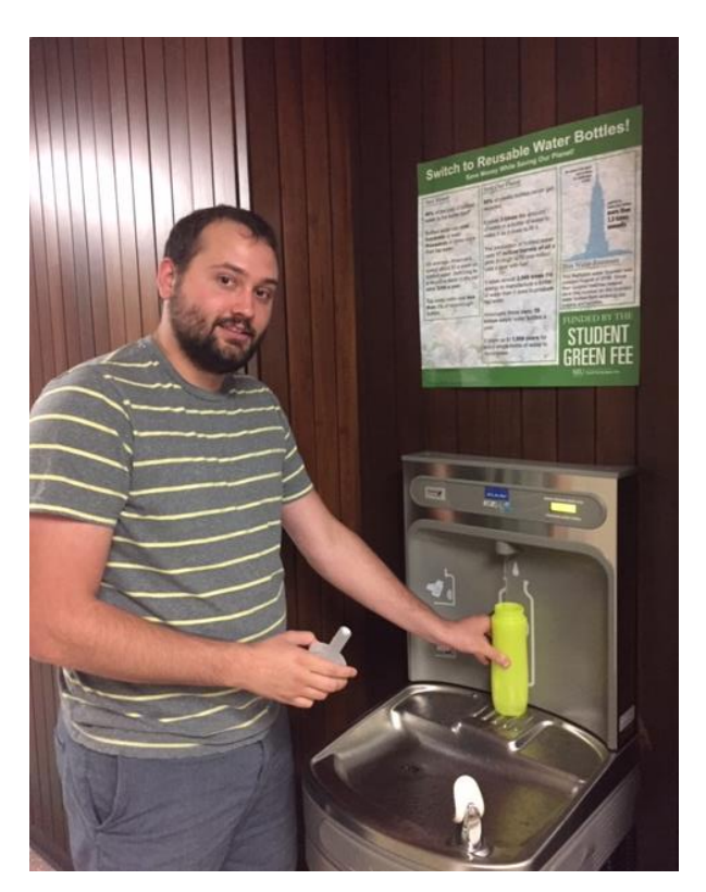
Student using the Elkay fountain