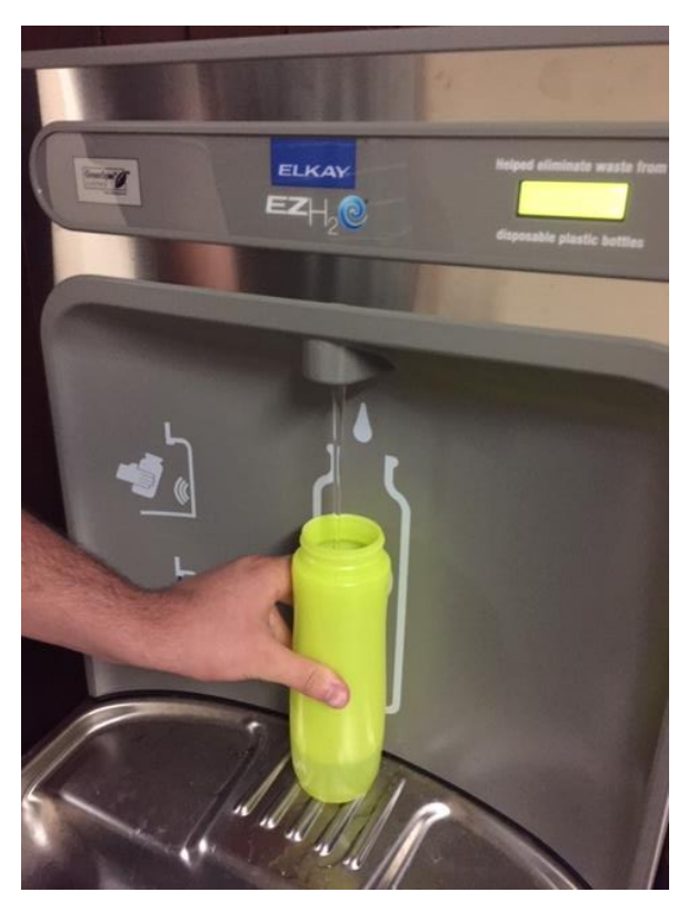
Water Bottle being filled up