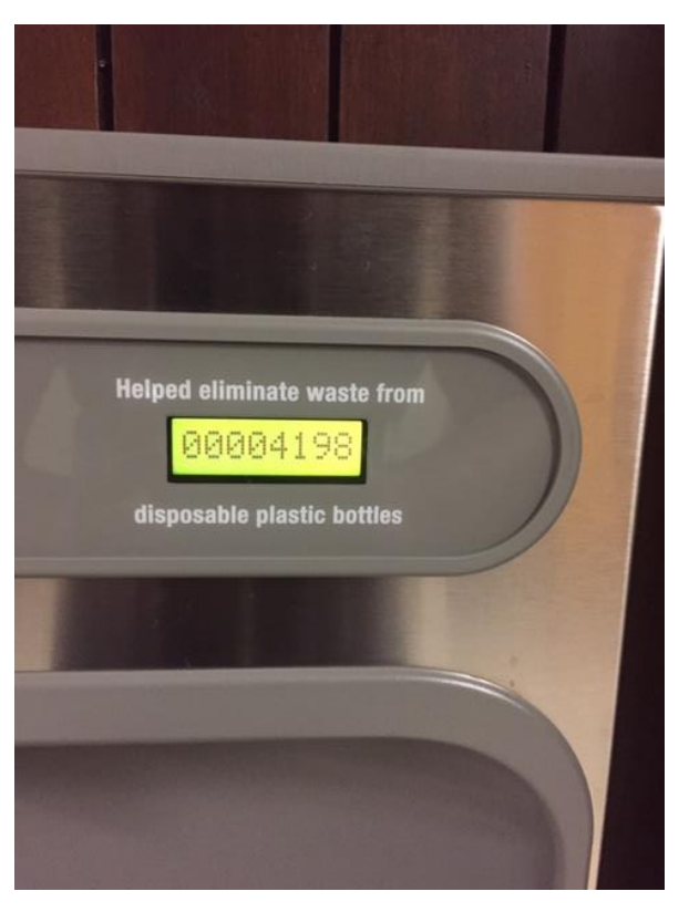
Water bottle waste eliminated as of 10/3/2019