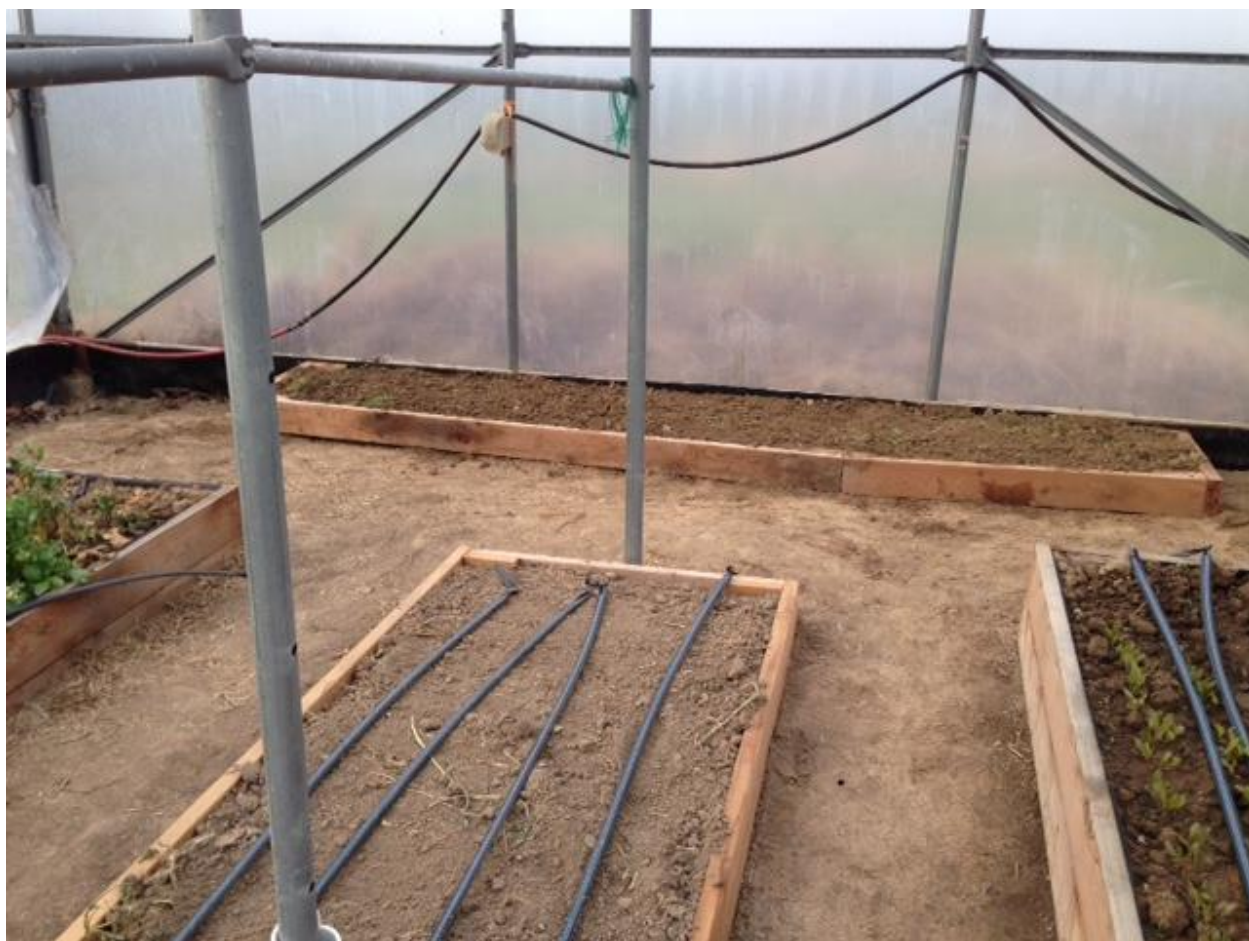
4 th bed installed