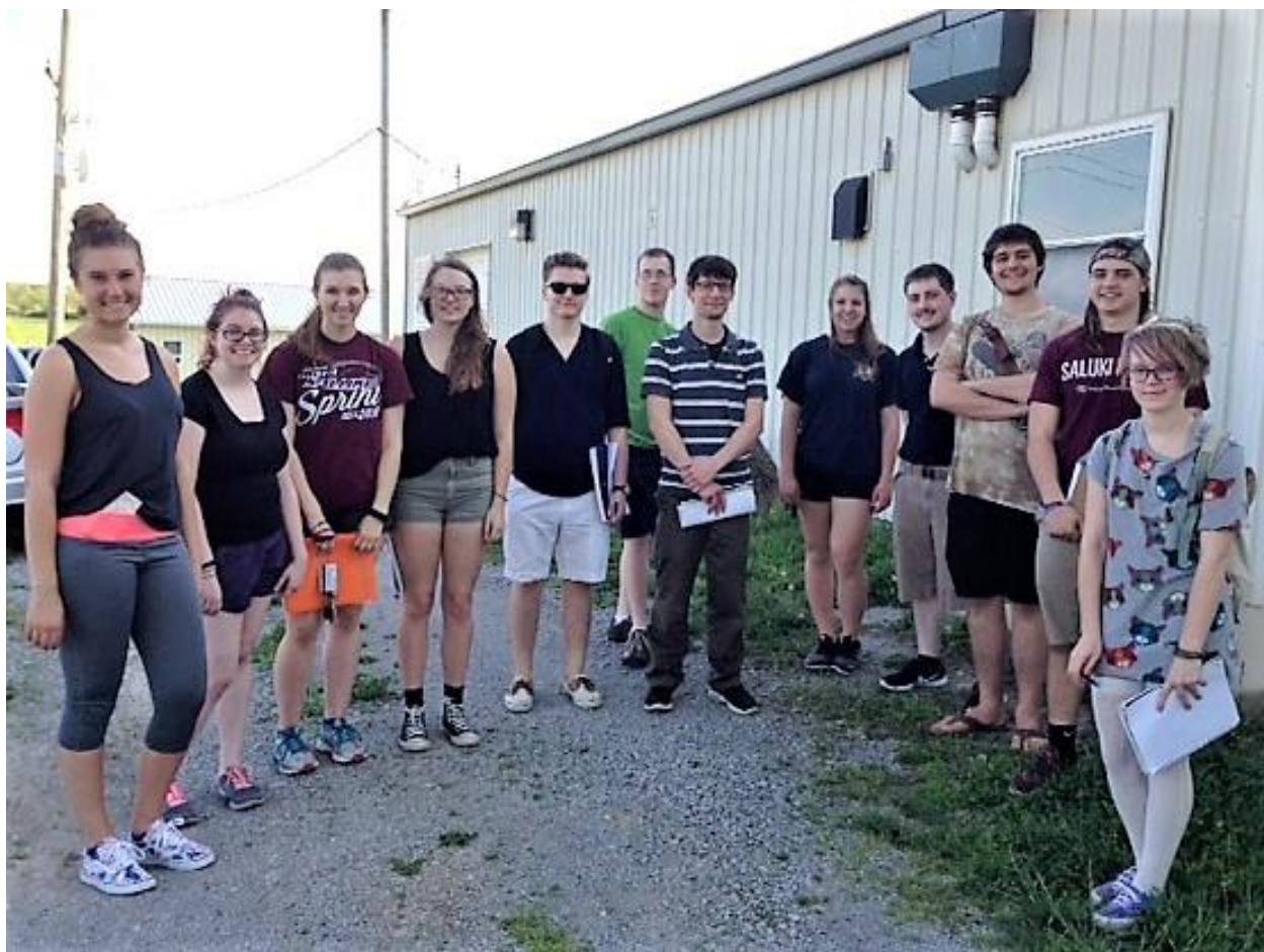
Visit from Philosophy Honors class