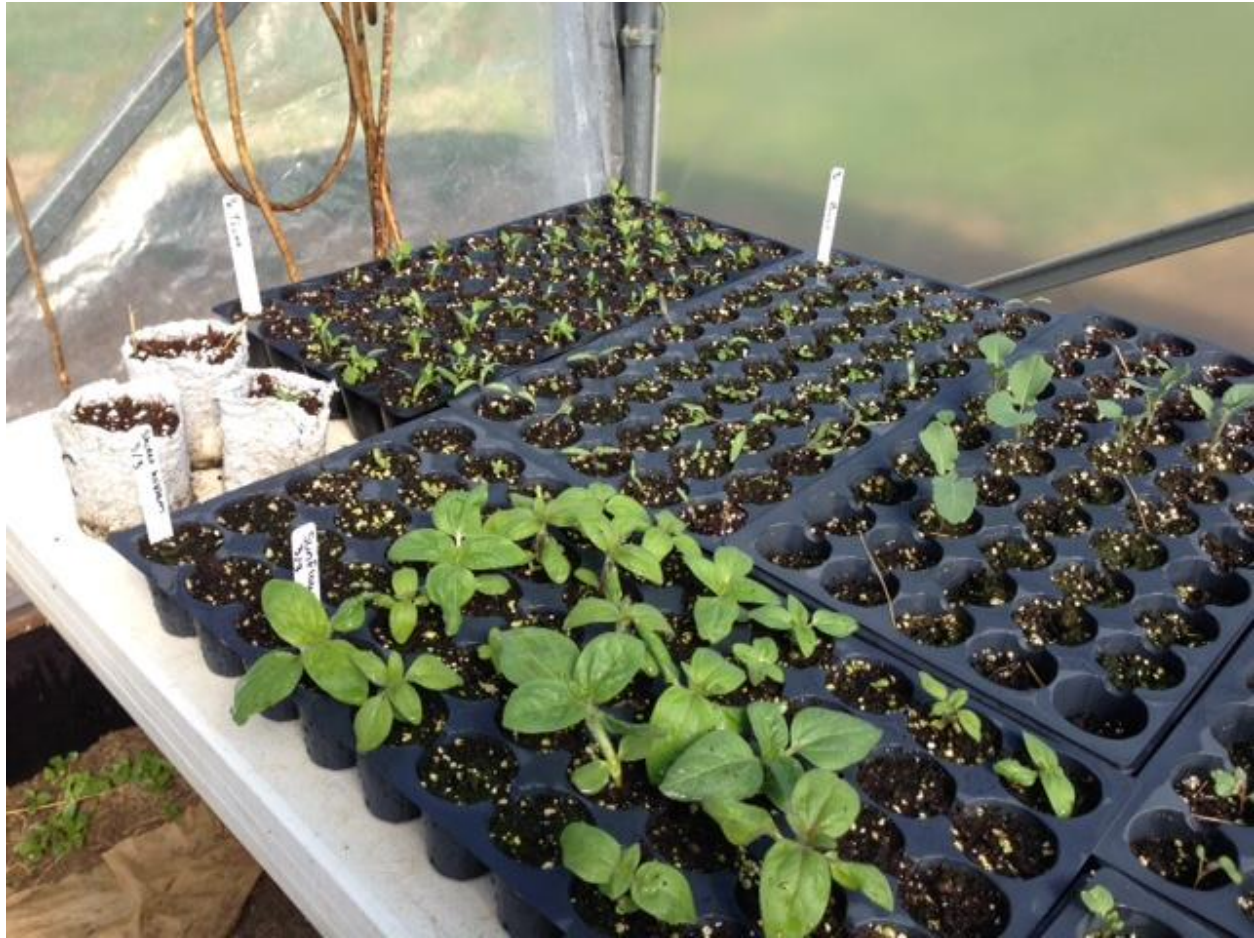
Spring seed trays