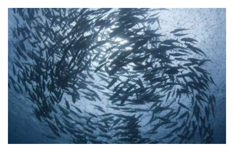
Phoenix Teams Up with Recyclebank to Tackle Waste and Recycling Goals.